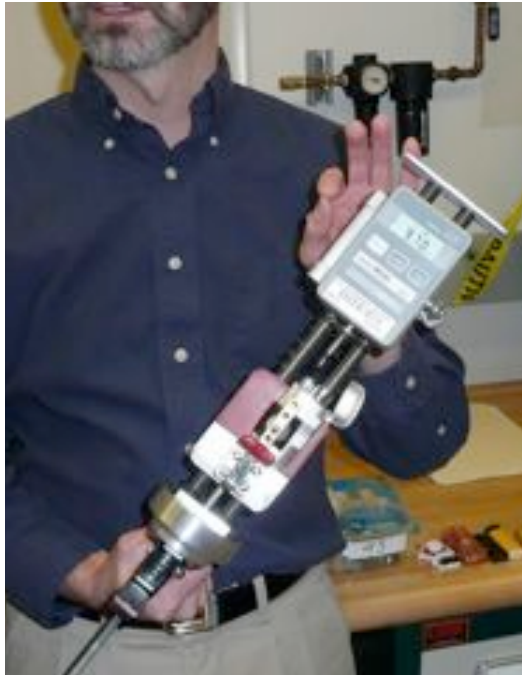
Cigarette Lighter Screening Tool